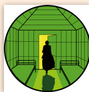
Mary Seacole (Green)