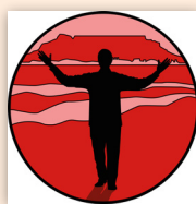
Nelson Mandela (Red)