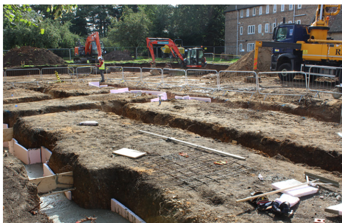
The foundations of the new Science Block begin to take shape (14.9.2018).

The Sports Hall Campaign offers students, parents and alumni the opportunity to have their name inscribed on a brick or paving slab which will be incorporated in the new building. Please click on the image to access the donation form.