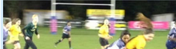
Senior B Team v Richard Hale

The Senior Girls A and B Rugby Teams took part in a rugby triangular against Richard Hale and Presdales on Tuesday 3rd December at Hertford Rugby Club. The girls worked extremely hard and were playing against tough competition. The A Team worked well together and narrowly lost both games. The B Team beat Presdales 8 – 4 and narrowly lost to Richard Hale by 4 tries to 3.