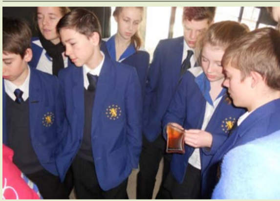
Looking at how Hand warmers work

On the 6th December ten students from Year 9 attended a Chemistry at Work morning at the Sele School in Hertford organised by Setpoint Hertfordshire. They took part in four workshops and enjoyed themselves finding out the chemistry behind popping candy and how to construct molecular models amongst other things. In February I shall be competing at Year 10 students to a Science/ engineering competition at GlaxoSmithKline in Ware. They will have to work together to complete certain tasks and will be competing against several other schools. Last year they had to improve the streamlining of basic Scalextric cars, and work out how to prepare the best rocket fuel to propel a plastic bottle across the gym. I wonder what they will come up with this year? In March we shall be sending a Year 8 team to the Festival of Chemistry in Cambridge to compete against other schools in a Forensic Science challenge. We won in 2010 and 2011 so are looking for victory again. Several Year 10 students are applying for places at one of the Salters Chemistry Camps during the summer holidays, and Year 12 are applying for Nuffield Work placements in all the STEM areas.